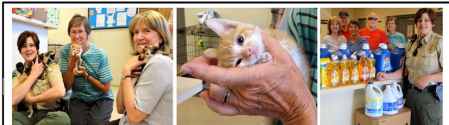
April Mission and Outreach Project...